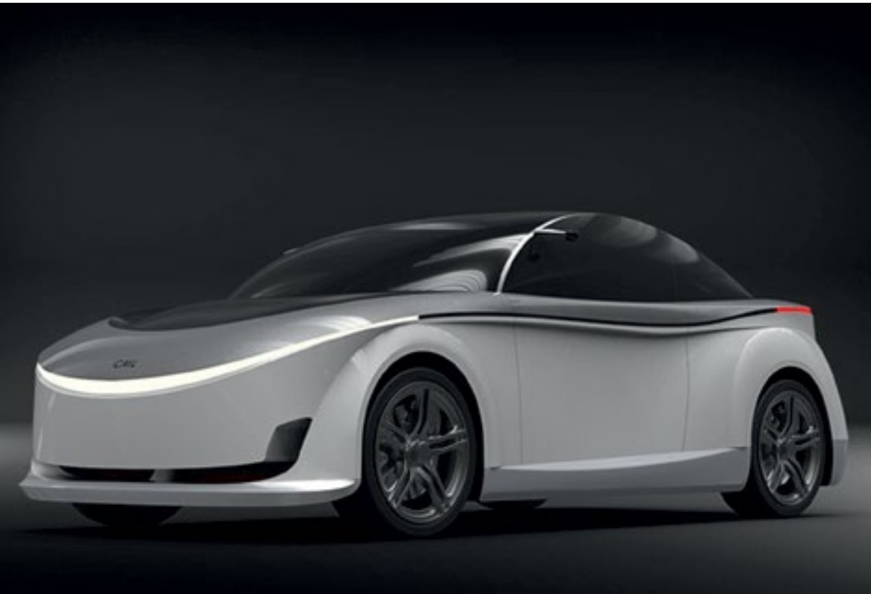
The customized electric CML-CAR, being developed in the Engineering Centre.