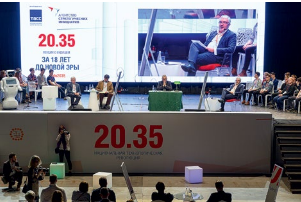
At the 20.35. The National Technological Revolution Conference. St. Petersburg, November 2017.